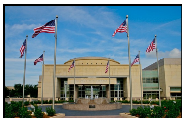
George Bush Presidential Library and Museum

CFRW will visit the Bush Library in College Station on September, 12, 2019