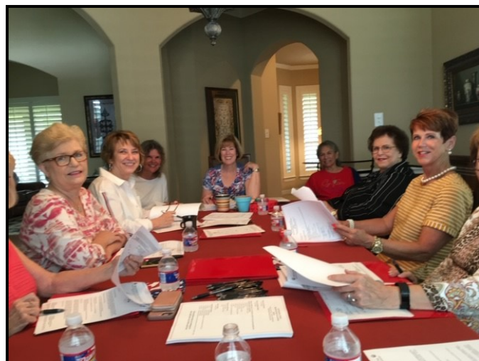
HHHT Committee at work