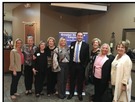
GHC Dinner Party with US Senator John Cornyn as guest speaker

Lunch will be at Messina Hof Vintage House Restaurant