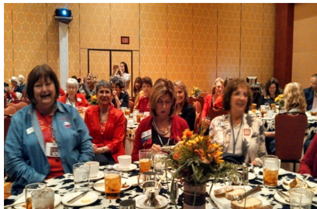
Above and Below: Wonderful speakers, great food and fantastic table partners made this a top-notch event!