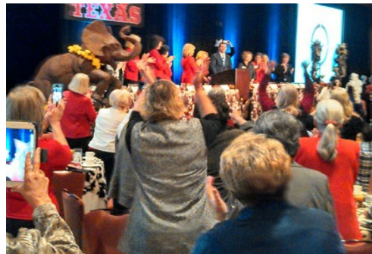
Senator Ted Cruz appreciates the 8-min standing ovation "welcome" by convention attendees