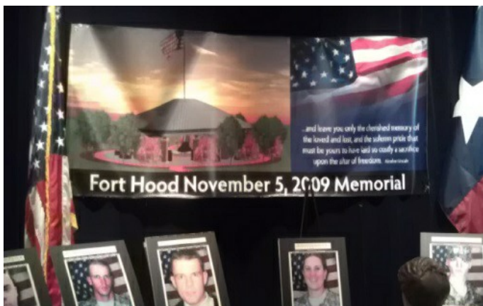
Poignant Fort Hood Memorial Presentation