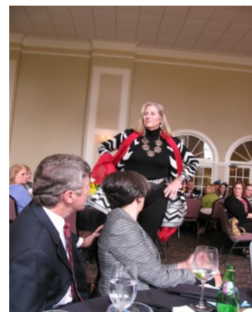
Judge Renee Magee - SuperModel