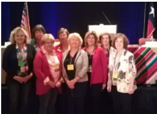
CFRW Delegation to the TFRW Convention