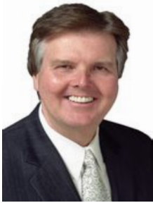
Senator Dan Patrick

Raveneaux Country Club 9415 Cypresswood Drive Spring, Texas