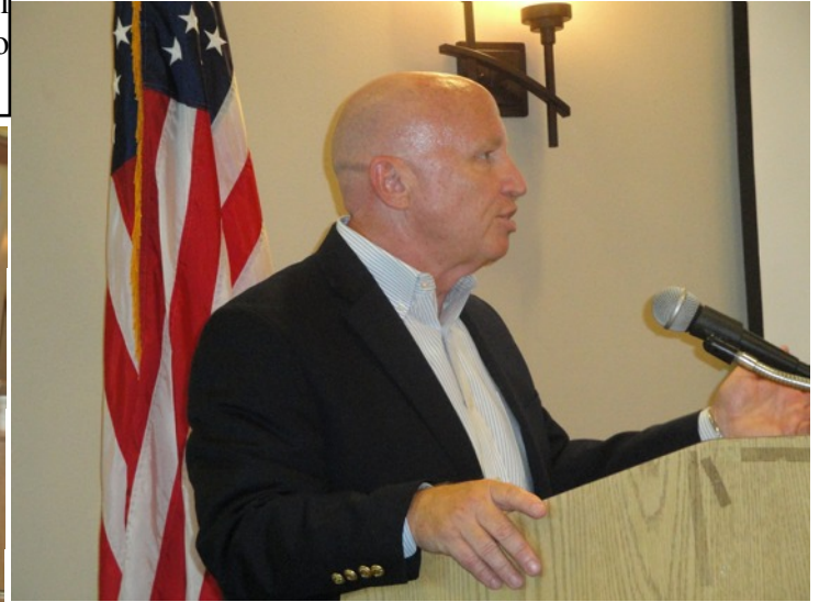
Our Annual August Social , which is held in the evening with appetizers and drinks was a tremendous success. US Congressman Kevin Brady gave an enlightening presentation and received a standing ovation!