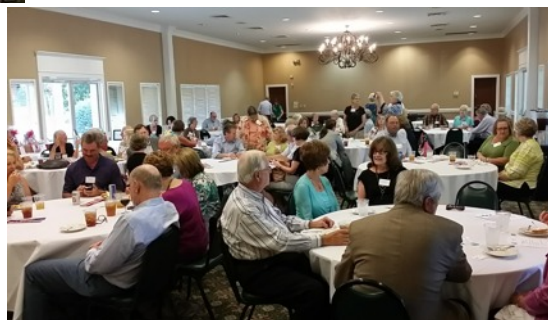
Full House for Congressman Poe