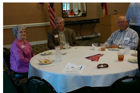
Our members enjoy visiting prior to the meeting!