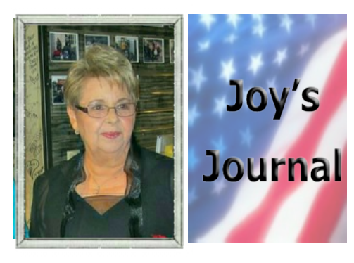
TEXAS GOP CONVENTION 2014 By Micheline Hutson Grassroots Club Chair

The Texas State GOP Convention is the largest in the country, dwarfing the RNC National Convention. Its simple purpose is to elect party leadership and adopt the rules and principles that will guide the party for the next two years.