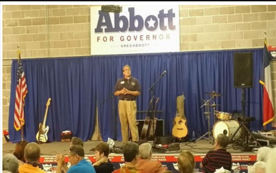
Congressman John Culberson