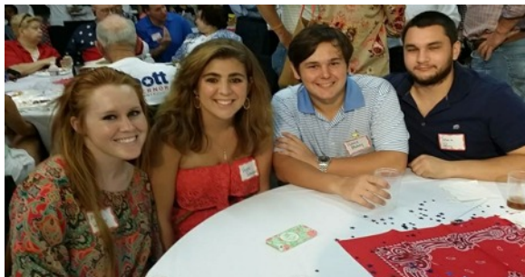
Young Republicans of Houston