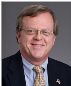
Senator Paul Bettencourt