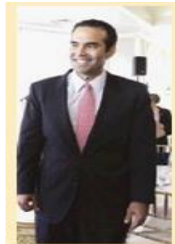
Land Commissioner-elect George P. Bush