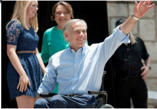
Governor-elect Gregg Abbott