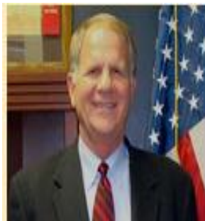
Congressman Ted Poe