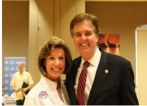
Lt. Governor-elect Dan Patrick