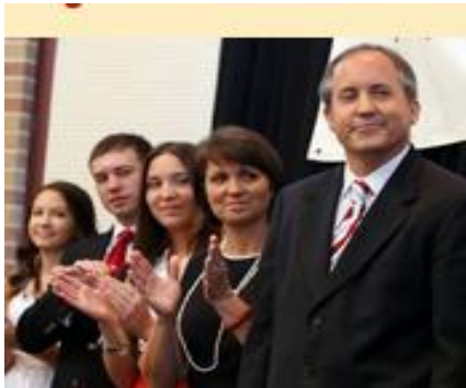
Attorney General-elect Ken Paxton