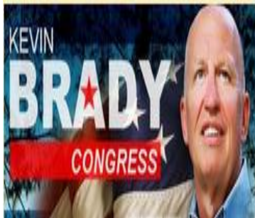
Congressman Kevin Brady