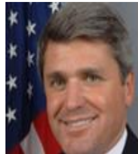
Congressman Michael McCaul