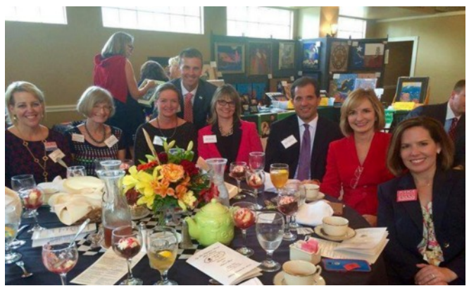
Fun and notable group at the CFRW High Heels & High Tea event!