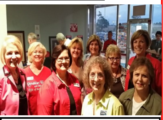
CFRW GOP State Convention Delegates @ NW HCRP training