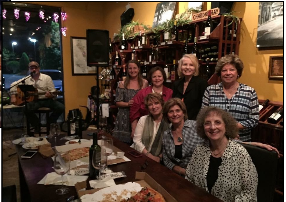
CFRW After Hours Event April 1, 2017